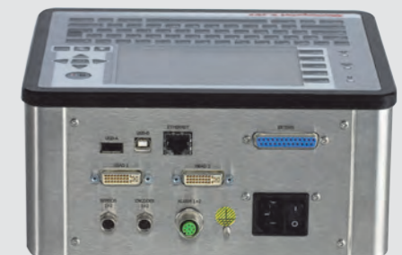
Ethernet Interface Data transfer from networks and access via web interface