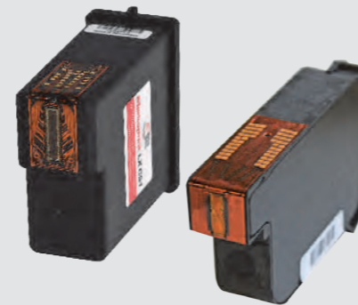
LX and HP cartridge Dual channel jet technology ensures perfect print quality