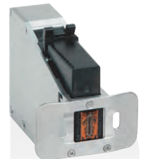
LX printhead (model 1)