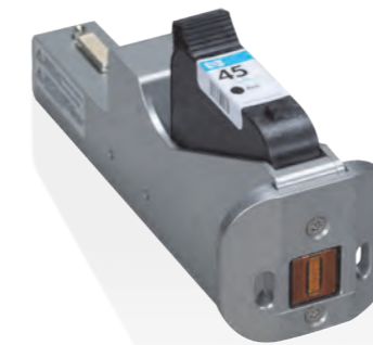
HP printhead (model 1)