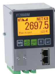
Module With Display

Dimensions W x H x D: 92 x 120 x 106 mm (3.6" x 4.7" x 4.2")