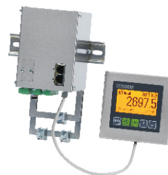
Display Unit And Blackbox

Display Unit W x H x D: 110 x 107 x 35 mm (4.3" x 4.2" x 1.4")